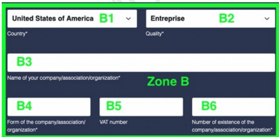
Information about your organization